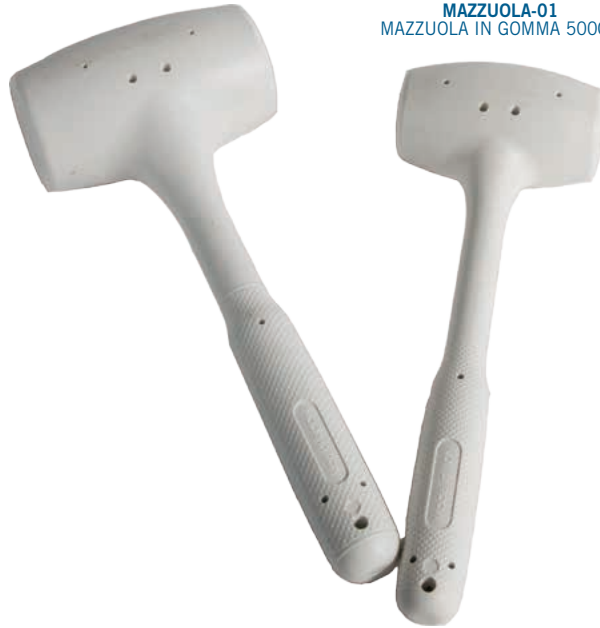
MAZZUOLA-01 MAZZUOLA IN GOMMA 500GR