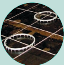
Esempio di installazione